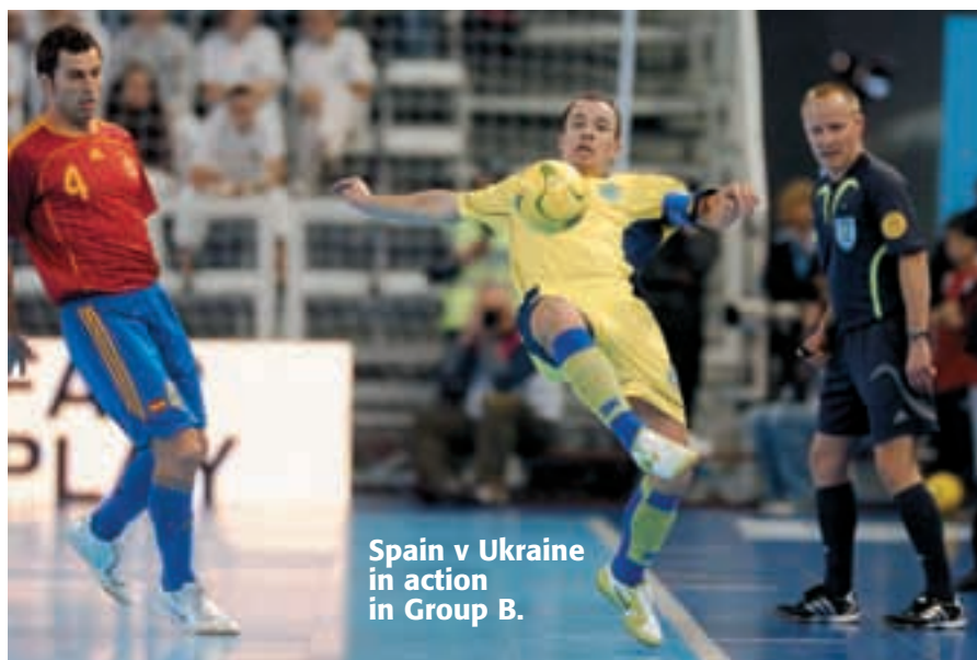
Spain v Ukraine in action in Group B.