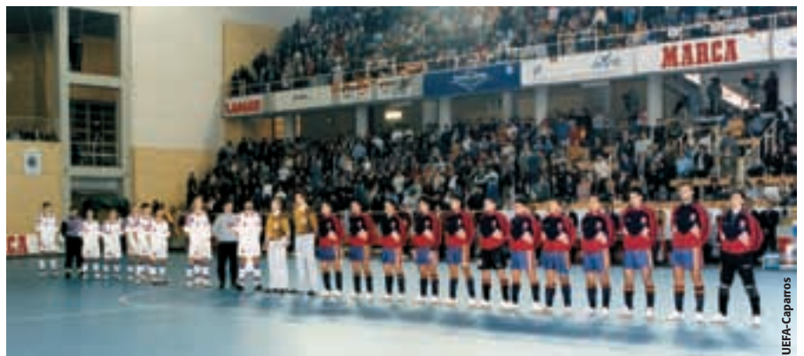
Russia and Spain met in the final in Córdoba in 1996.