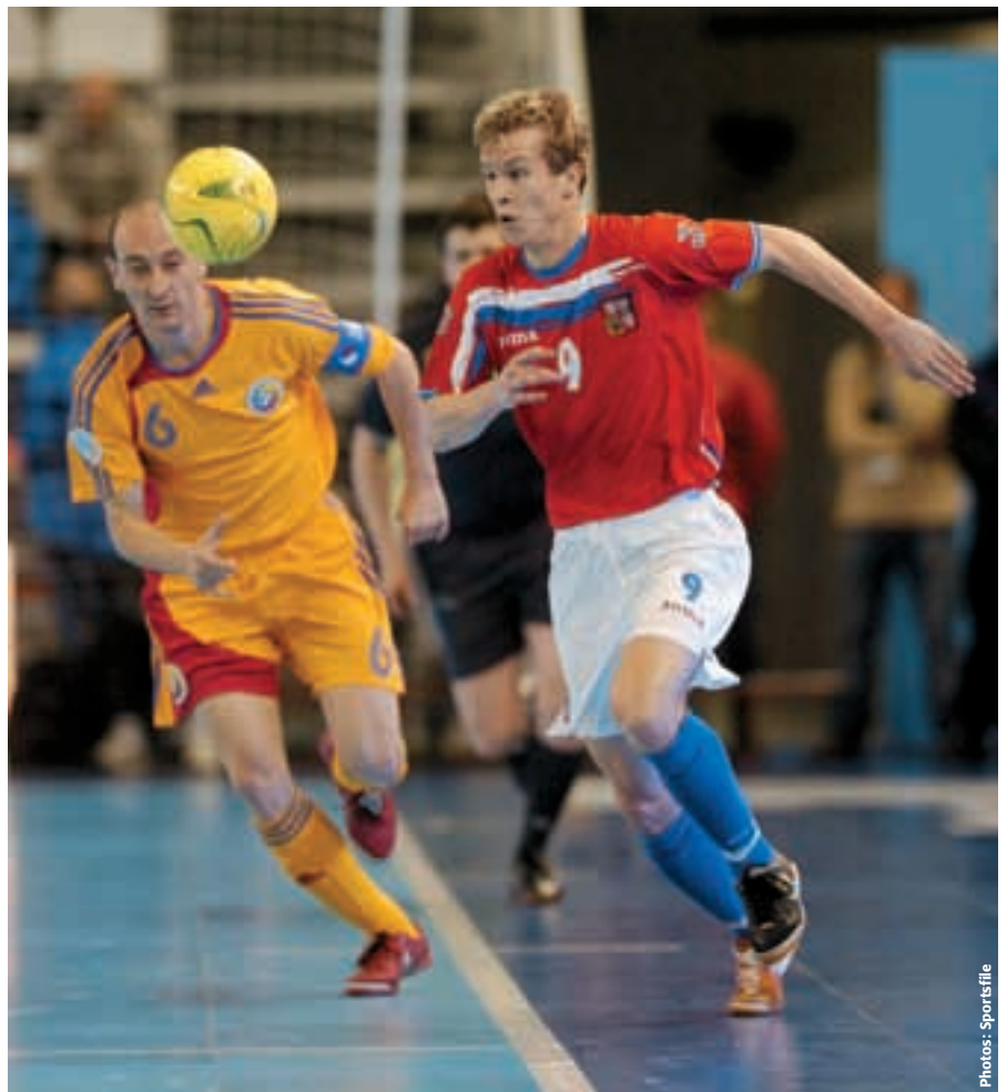
Romania v Czech Republic in action in Group A.

team was awarded a corner kick and it took 12 to 15 seconds for the ball to be placed and the player to roll the ball into play. That, for the TV spectator, sows the seeds of boredom. And the same applied to kick-ins. The referee might start counting seconds once the ball is placed – but how long did it take to place the ball? If we give them four seconds to get the ball into play, should we give them a maximum of six seconds preparation time? I think a total of ten seconds is reasonable in a sport which is renowned for the speed of its match action. I know we are guaranteed 40 minutes of play but, if you look at the statistics for real playing time in Portugal, you can easily calculate how much time was lost. In some cases, it was so much that the teams playing the second match of