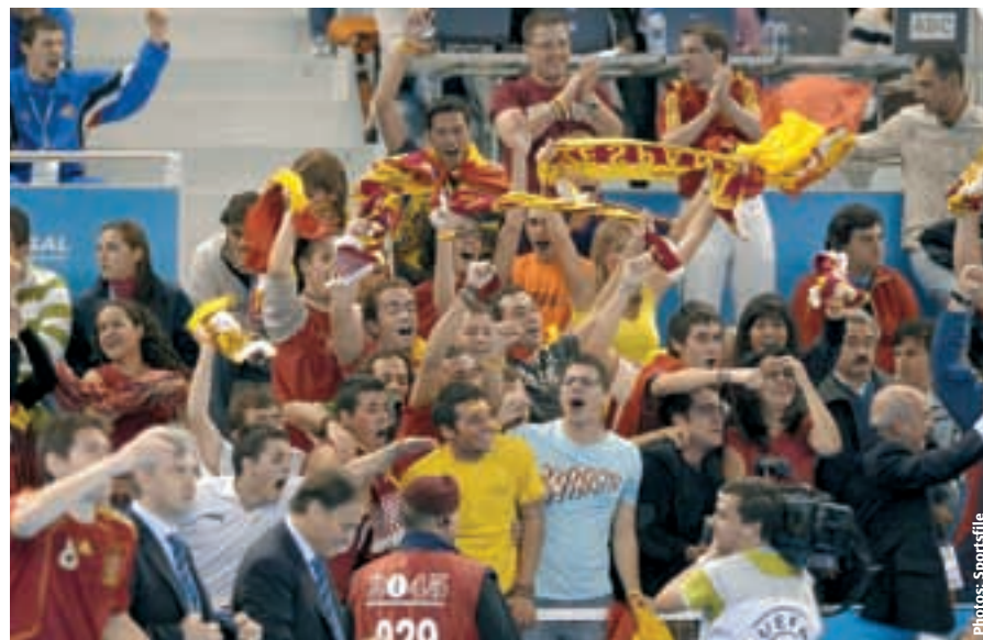
A large and enthusiastic crowd attended the final of the European Futsal Championship.

point of view because they have much more contact with the ball. That's why football clubs have become aware of the value of futsal in youth development. We have futsal teams from early ages and a national league at youth level as well as regional competitions, from which the champions go on to dispute the Spanish championship. At all age levels. In terms of representative selections, there's a similar situation, as teams from all the autonomous regions compete for the national title. In every age bracket right down to Under-10s."